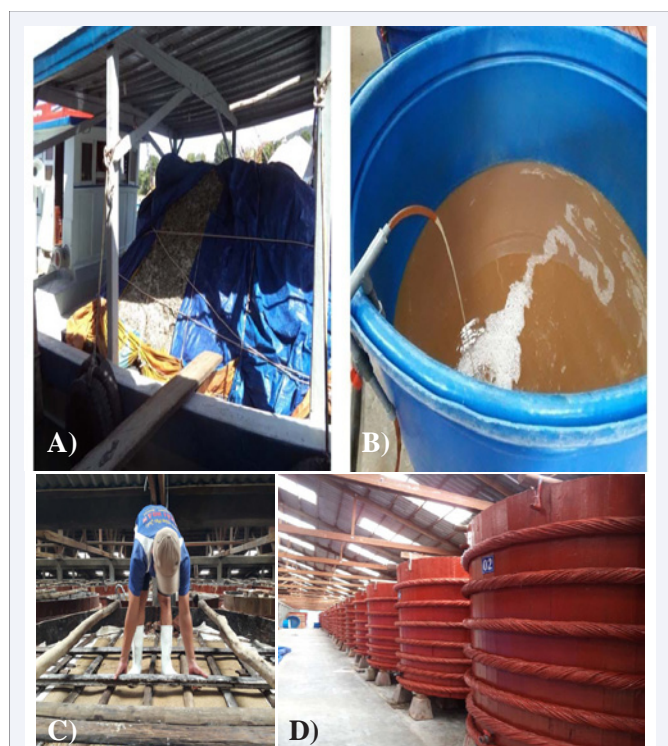
Figure 3 a) The salted anchovy in landing, b) Recirculation of liquid from salted fish, c) Set up the wooden frame in the surface of the salted fish, d) The line of wooden vats in a traditional nuoc mam processing factory in Phu Quoc.

As the definition, nuoc mam is the liquid that contains mainly a mixture of peptides, amino acids as well as minerals dissolved from the fish, which makes nuoc mam being the resource of essential amino acids. Comparing to fish sauce from Asian countries, the nuoc mam in Vietnam is rich of aspartic acid, threonine, glutamic acid, leucine and lysine [15,16]. Due to the high salt concentration, nuoc mam is only used as condiment with